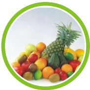
Prepare vegetable and fruit materials 1

This machine is provided with one touch type "Vegetable & fruit key". The fruits and other materials are put into the cup according to the vegetable & fruit making method introduced in the book "A Special and Natural Regimen". The operator only needs to press the "Vegetable & fruit key" and the making of a whole cup of fruit juice can be finished.