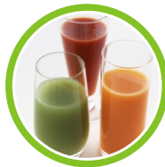
Enjoy nutritious and delicious vegetable and fruit juice. 5