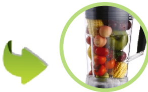
First put the soft slices of vegetable and fruit (e.g. tomato and grape) at the bottom of the blender. Then put the hard slices of vegetable and fruit (e.g. beetroot and carrot) above them.